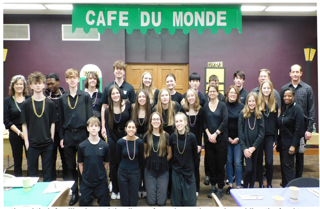
These youth and their families hosted the dinner, from decorating and providing the food to serving to cleaning up afterward. They'll be traveling to New Orleans in June for service.