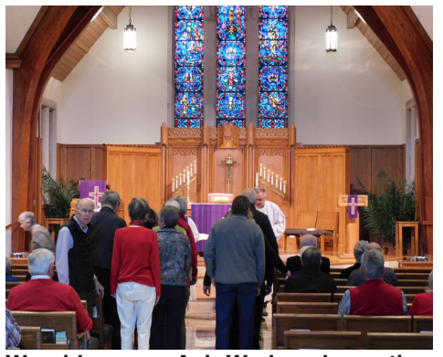
Worshipers on Ash Wednesday gather at the altar for ashes at the beginning of the service. Since the service was on Valentine's Day, several people wore red.

We are called to welcome, nurture, equip and send Next issue of the VOICE is dated April 7, 2024.