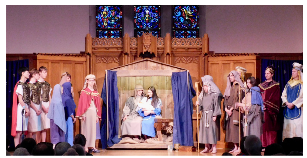
Joy to the World! Let every heart prepare him room.