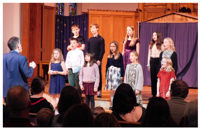
New Creation Choir on Pageant Sunday