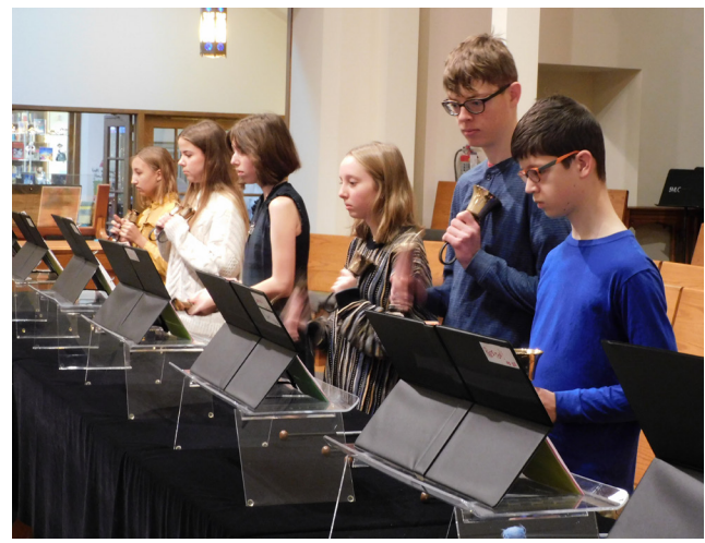
Righteous Ringers handbell choir