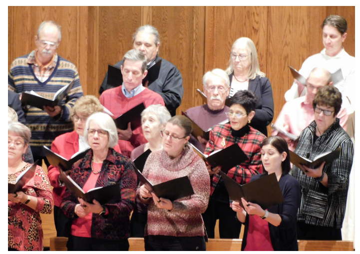
The nativity story was also proclaimed in music by the inspiring singing of the Senior Choir.