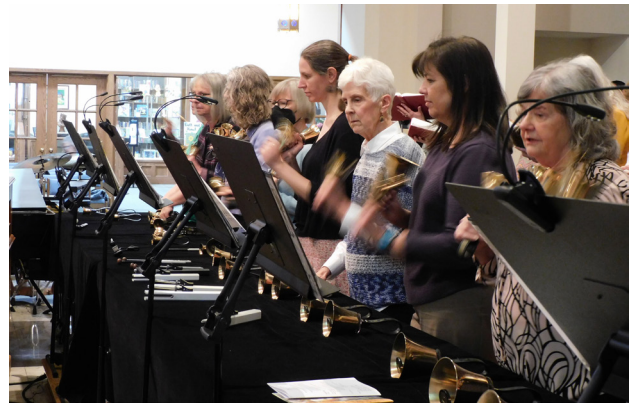
Bells Angels handbell choir