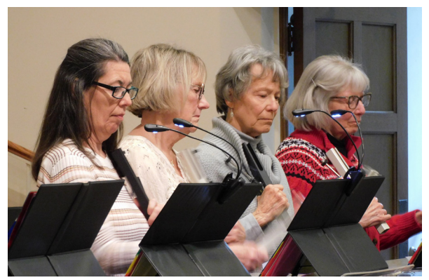
Embellishments handbell choir