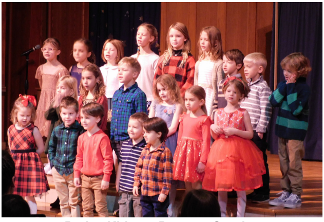
Praise Kids on Pageant Sunday