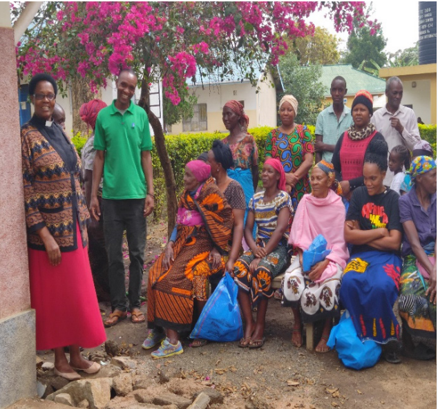
Food is distributed by the pastor of Sing'isi Lutheran Church to people who are food insecure, many of whom are widows.