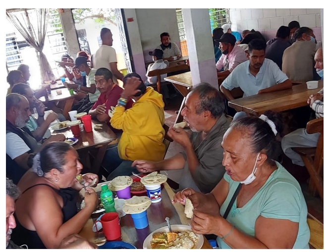
Top: El Ministerio Amor y Solidaridad en Casa Esperanza (The Love and Solidarity Ministry at Hope House) serves a nourishing lunch, offers showers and laundry facilities, and provides a place where all are treated with dignity in an area where many people are homeless.