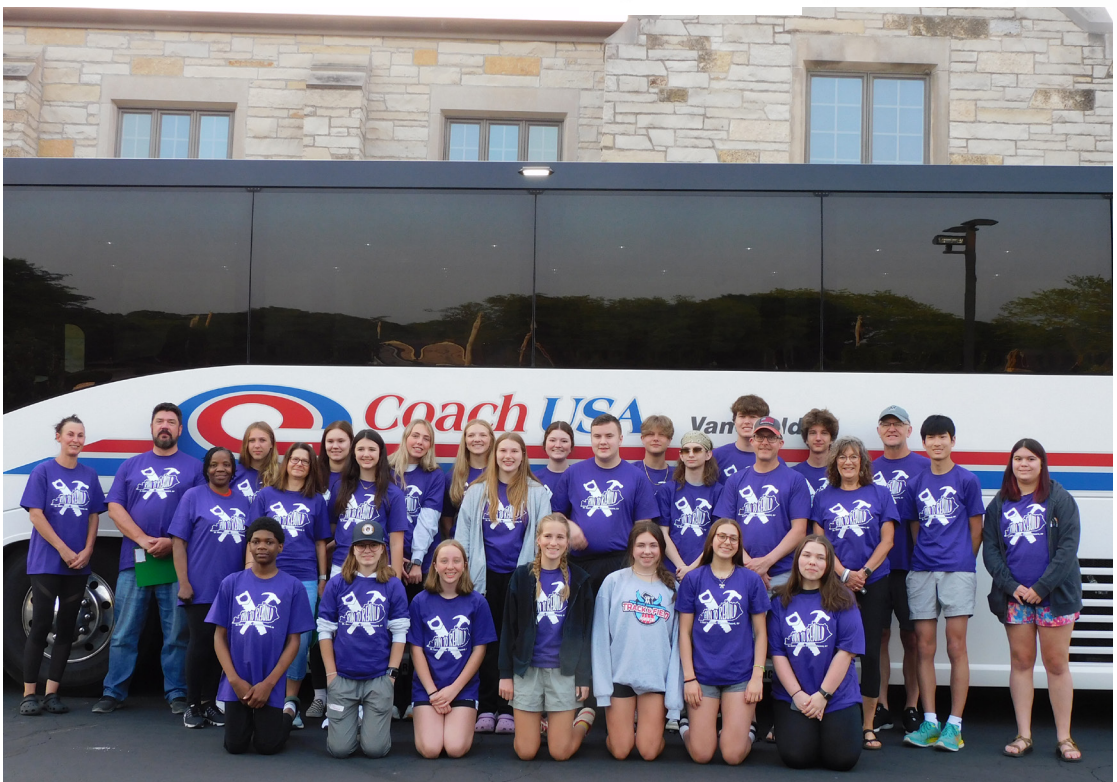
One would never know from the bright faces that this photo at departure was taken at 6:30am