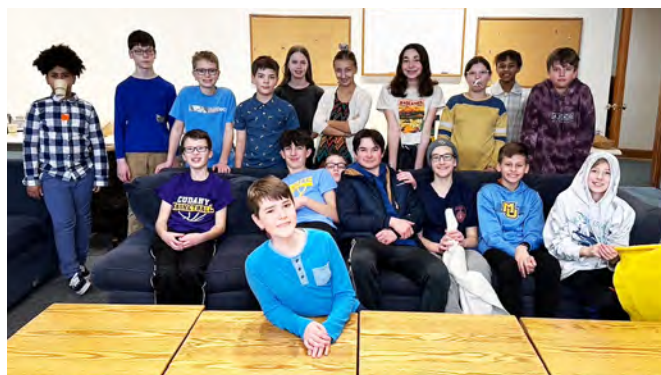
Middle School Game Day