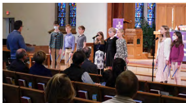
New Creation Choir