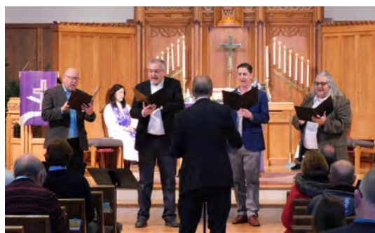
Grace Note Quartet singing "Prayer of the Children"