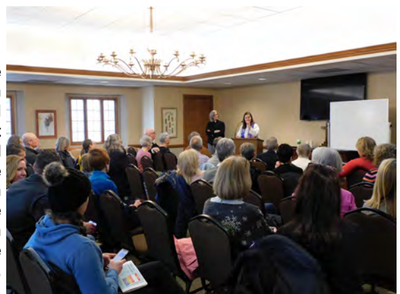
The large crowds at each session as well as the excellent questions and feedback indicate broad interest in continuing these conversations with curiosity, courage and compassion.