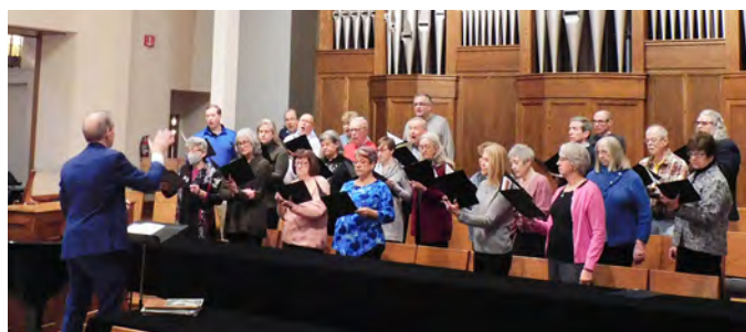
Senior Choir Sunday morning warm-up