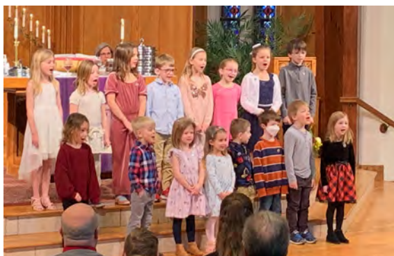
Praise Kids Children's Choir

Next issue of the VOICE is dated May 7, 2023.