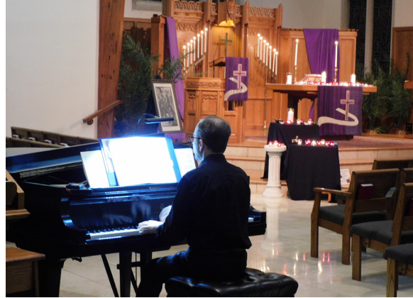
Lenten worship services on Wednesday evenings set a tone of quiet reflection with a beautiful display of candles around the chancel.