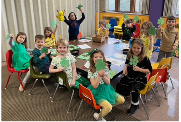
The 5-K class had fun decorating and cutting out shamrocks on St. Patrick's Day.

In the Art classroom, kids talked about how all of the parables show us how much God loves us, and they made hearts using the Iris Paper folding technique. In this photo, second graders display their creations.