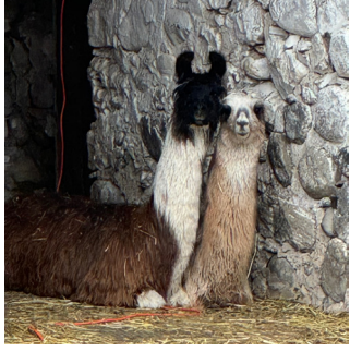
A unique aspect of the Cedar Valley Retreat Center is the llamas on site.