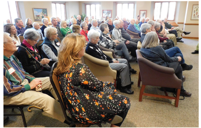
Large crowds have attended the 3-part series on the Holy Land, wanting to learn more about the long conflict.

The 3-part adult education series on the Conflict in the Holy Land can be accessed on our Youtube page, allowing you to watch the videos of the presentations any time. Go to our Youtube page: Youtube.com/StMattsTosa and search for adult education playlist.