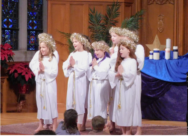
Third and fourth grade angels bring tidings of great joy to the shepherds.