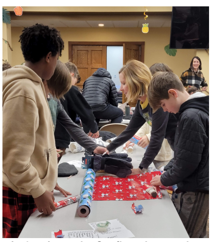
7th & 8th grade Confirmation students wrapped gifts for the Allies for Teens in Foster Care gift bags.