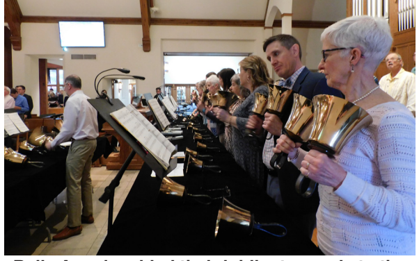
Bells Angels added their jubilant sounds to the Easter message.