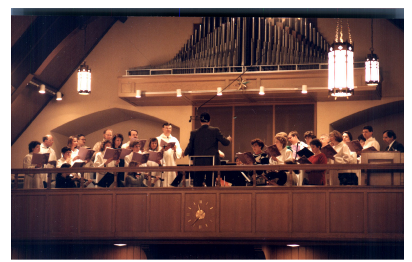
This photo from the mid-1990s shows the home of the choir before the remodeling when the sanctuary perspective was turned 90 degrees. The balcony was at the back of the worship space.