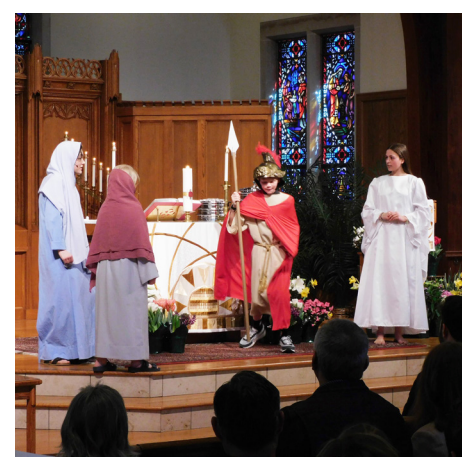
The scene at the empty tomb was created in drama with the Marys, a guard and an angel.