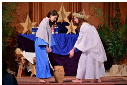
Photos of the S.S. Christmas Program in 2019.